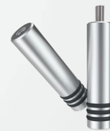
12 set of connectors