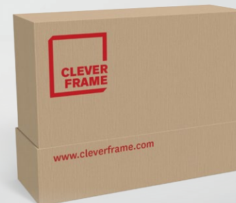
Additional in the set: 2 x graphic panel bag 1 x connectors bag