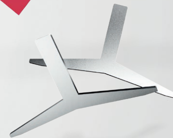
2 x PROMO1 foot