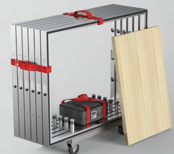
Trolley and PROMO1 top 75x50 cm