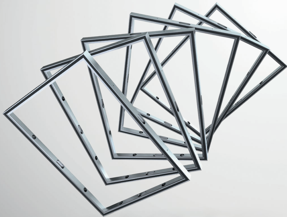
6x frame 100x75 cm