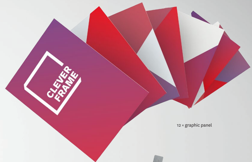
12 x graphic panel