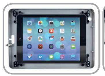
5. The enclosure is now ready to accept the iPad Air.