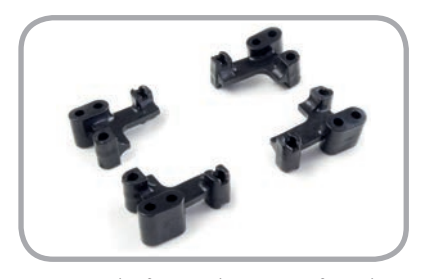
3. Remove the four iPad Air inserts from their packaging.