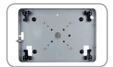
4. Position holes of iPad Air inserts over locating pins and gently push-fit into enclosure.